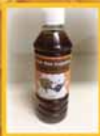
Raw Hive Oil